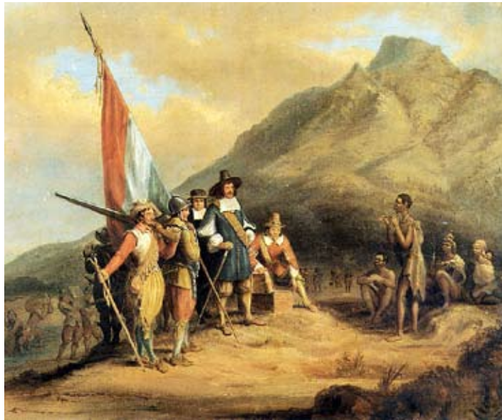
The Dutch settle the Cape in 1652.

texts for muscling in. The climax of this new British-Afrikaner conflict was the Boer War of 1899-1902. The Brit-